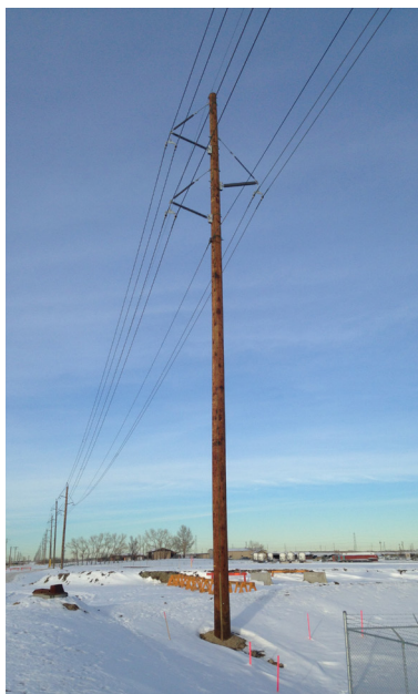
Example of Wood Pole

The proposed single circuit transmission structures will be self-supporting laminate poles and will have a height of 23 to 32 metres (75 to 105 feet). The current wooden poles being replaced are approximately 20 to 22 metres (66 to 72 feet) in height.