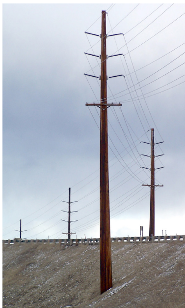
Example of Laminate Pole